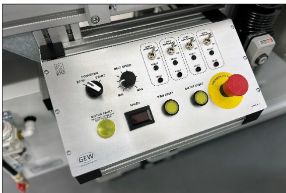
The control panel enables individual switching for each lamphead, as standard.